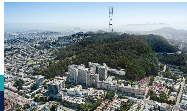
Aerial view of Parnassus campus, Mount Sutro, Sutro Tower, and surrounding neighborhoods

The south side of this courtyard is bordered by the Health Sciences West (HSW) Building, with the Health Sciences East Building hidden behind it. The curved structure on the hillside above HSW houses the Institute for Regeneration Medicine. These buildings, which are not accessible to visitors, provide space for student education and research.