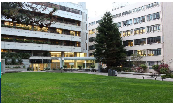
HSW Building and School of Nursing, bordering Saunders Court

Proceed up the stairs (or the elevator down the hallway under the stair to the left) to the second floor. Visitors can relax in the second-floor lounge space or continue through the unmarked white door at the top of the stairs. After you go through the white door, cross the hallway to the glass doors and exit the building. Your tour continues along an awning-covered pathway where you can view Hank Willis Thomas and Ryan Alexiev's The Truth is I Am You , a series of twelve speech balloons, highlighting the diversity of cultures that exemplify the UCSF community. Each line of the poem is translated into one of 24 languages spoken by the student body.